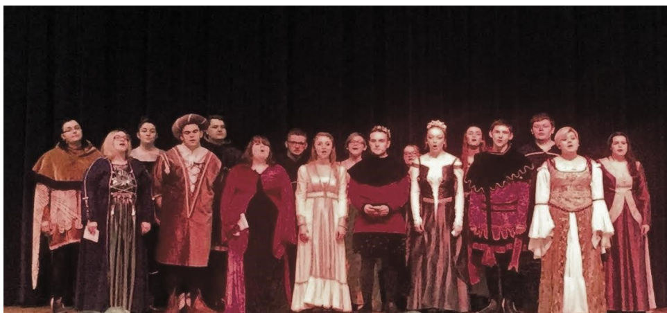
The LaVile Madrigal Singers provided much-welcomed entertainment at our annual Christmas Party in December.

Yours in Lionism, IPCC Vic President Lakeville Lions Club